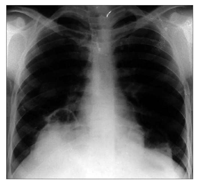
Figure 1. Frontal chest radiograph shows basilar opacities with air-fluid levels.